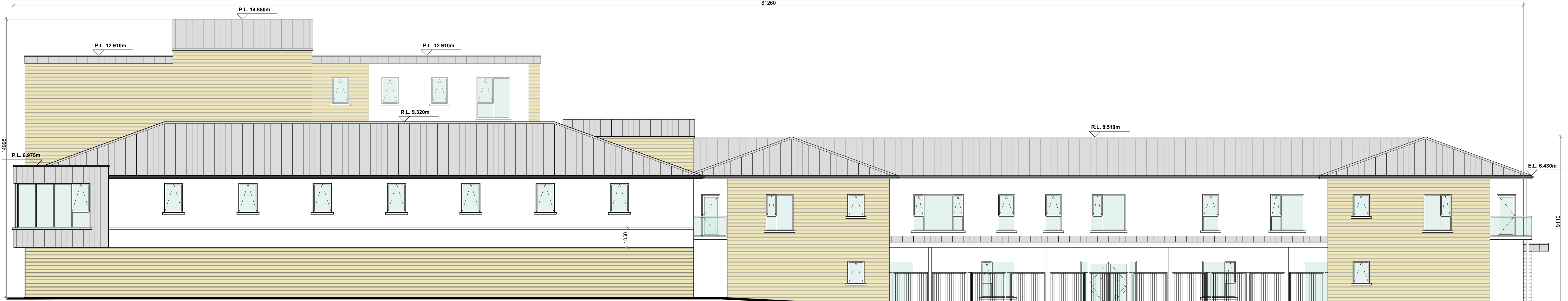
NEIGHBOURHOOD CENTRE (NORTH-WEST) ELEVATION @ 1:100

DO NOT SCALE. USE ONLY FIGURED DIMENSIONS WHICH SHOULD BE CHECKED ON SITE BEFORE WORK COMMENCES. ALL WORK TO BE CARRIED OUT IN ACCORDANCE WITH THE LATEST BUILDING REGULATIONS. REFER TO STRUCTURAL ENGINEER'S DRAWINGS AND SPECIFICATION FOR ALL STRUCTURAL WORK. THIS DRAWING IS COPYRIGHT.