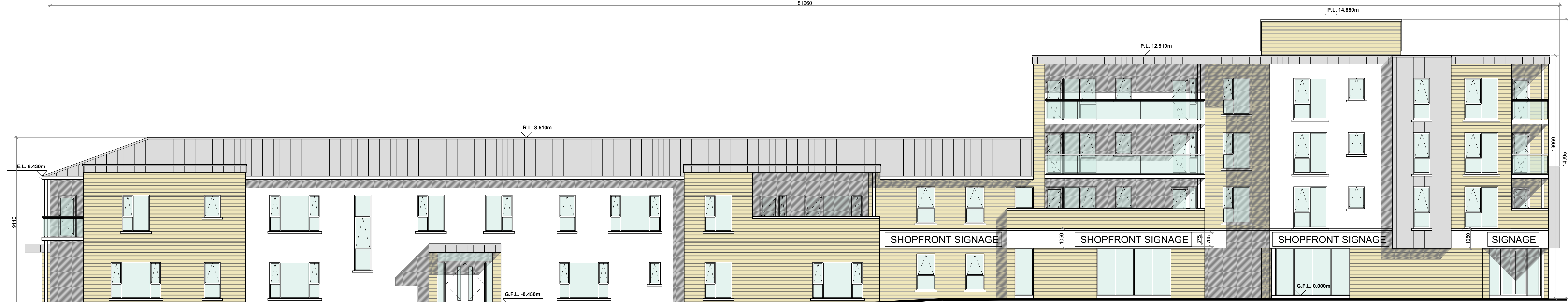
NEIGHBOURHOOD CENTRE (SOUTH-EAST) ELEVATION @ 1:100