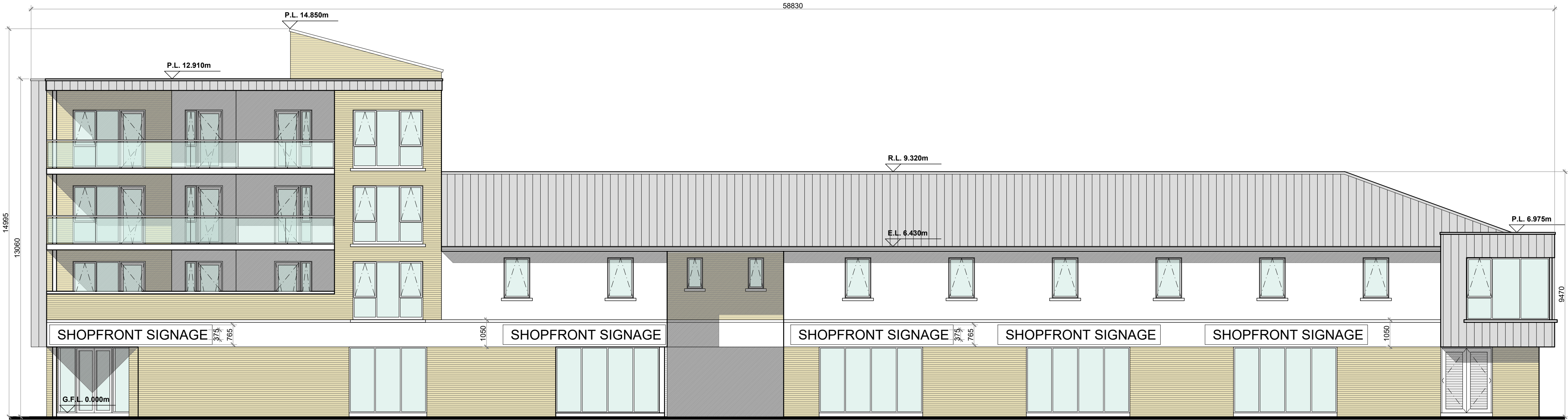
NEIGHBOURHOOD CENTRE (EAST) ELEVATION @ 1:100