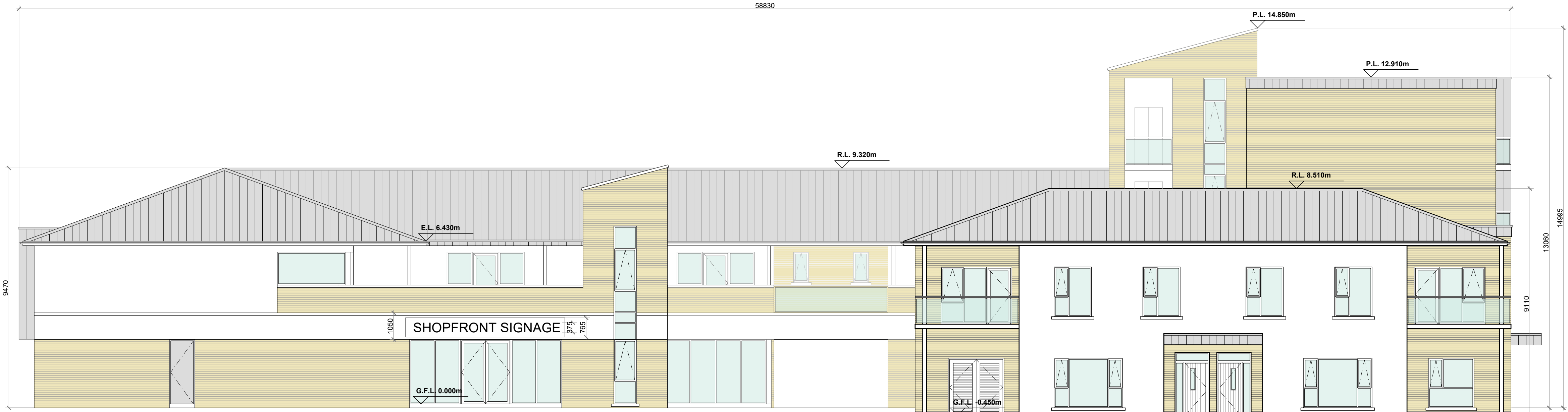
NEIGHBOURHOOD CENTRE SOUTH-WEST ELEVATION @ 1:100